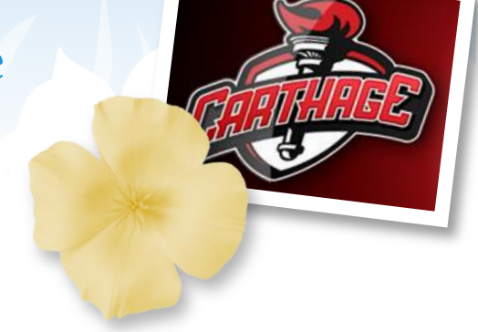
Sigma Alpha Chi at Carthage College

2001 Alford Park Drive Kenosha, WI 53140